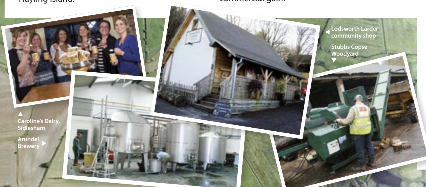
▲ Caroline's Dairy, Sidlesham