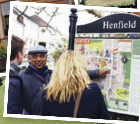
Henfield visitor project