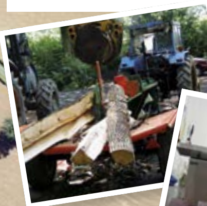
W.P. Duthie Logs & Forestry Services