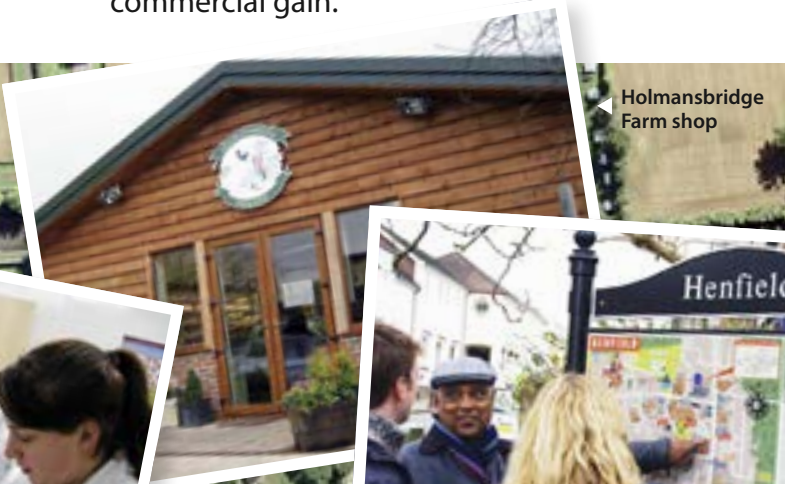
Holmansbridge Farm shop