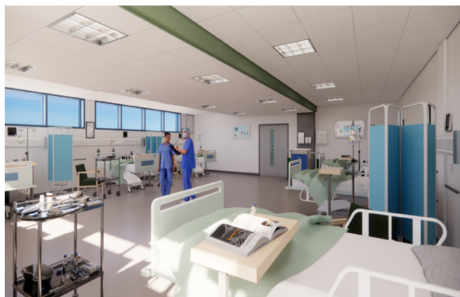
Photo: Artist impression of the mock-wards located at the University of Chichester's new nursing school (£1.2 million Getting Building Fund allocation)

This work is based on our significant efforts to build a comprehensive picture of the regional economy. This analysis is hugely valuable and underpins our work. We will maintain and further develop this knowledge to ensure its continued relevance and will use this to consider the development of additional services to partners and businesses.