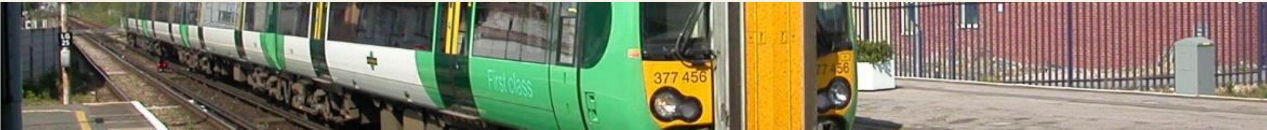
Comparative Travel Times and House Prices between destinations on the HS2 Route and in Coast to Capital

Worthing Commute: 80mins Average house: £257k